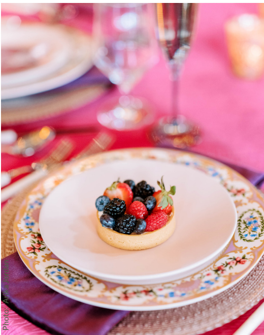
Fresh Fruit Tart